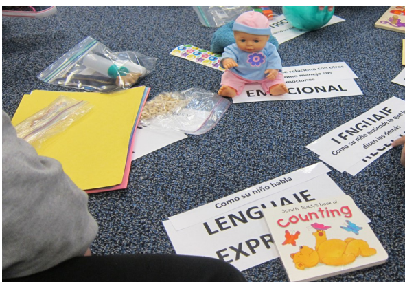
Parents worked through the 5 domains of the screening with their child, guided by CCF's developmental specialists

New to the Juega Conmigo (Play With Me) program this Spring, all children enrolled in the program received a developmental screening in February. Juega Conmigo serves children ages 0-3 together with their parents through playful-learning activities. Parents were always offered a developmental screening for their child if interested but this Spring, all children were screened for delays at all 5 Juega Conmigo program sites. Using a group screening model, developmental specialists worked through the 5 domains of the screening (communication, problem-solving, gross motor, fine motor, and socio-emotional) with the parents in a group setting, providing guidance and information about their child's development throughout the course of the screening. With this process, 63 children were screened and 25% of them were referred for further evaluation and therapy services. All parents received follow ups after the screening to ensure their connection with services and recommendations to promote their child's optimal development.