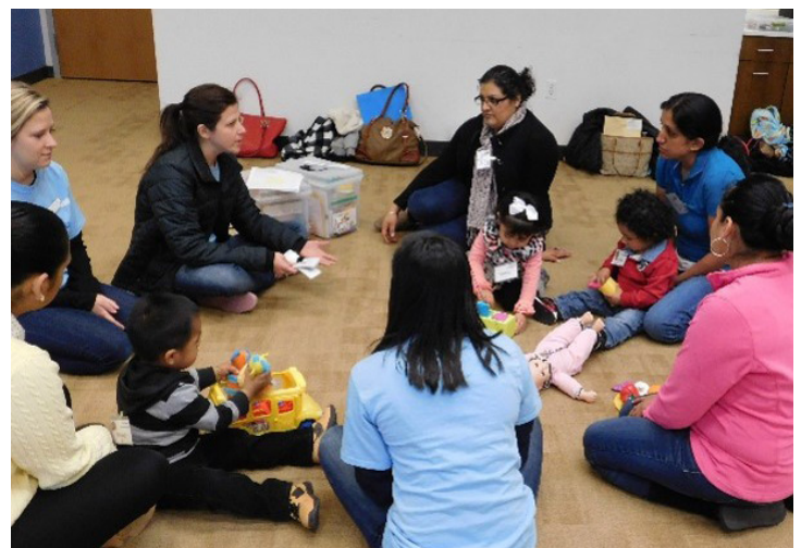
Group developmental screenings at a Juega Conmigo class