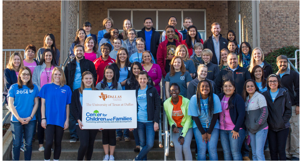
Dobie Elementary School's Family Literacy Center partnered with CCF and the Callier Center for Communication Disorders to provide screenings for their students