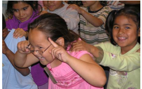
13: Freese Kindergarten Cooperation Conga Line: Body Movement Theater Warm Up

During the school year, each Freese teacher has four arts rotations and spends two months (eight sessions) working with an artist on a specific project before moving to another artist and art form. Earlier, the benefits that a puppetry lesson on “Three Billy Goats Gruff” had for English language learners were discussed. However, little was said about the benefits that such a lesson had for the class as a whole. A first grade teacher recalled that same production: