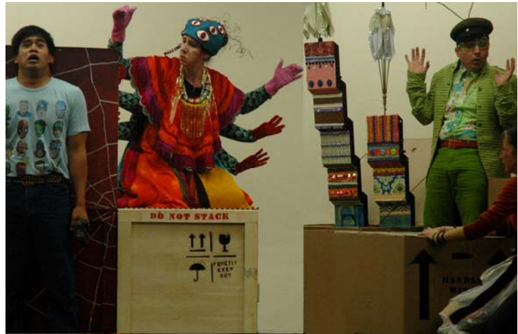
3: La Jolla Playhouse Student Pop Tour performing at Freese Elementary in San Diego, California.

This article looks at a cultural arts magnet school that has focused steadily on imparting such intellective competencies to students living in a diverse community only 20 minutes by car from the United States-Mexico border. Located in the southeastern corner of the San Diego Unified School District, Freese Elementary was not only the first school to implement the Mapping the Beat curriculum after it was funded by a grant from National Geographic, but it has continued to pursue arts integration across all grade levels through its Cultural Arts Magnet Program, building a vibrant school culture in a turbulent neighborhood.