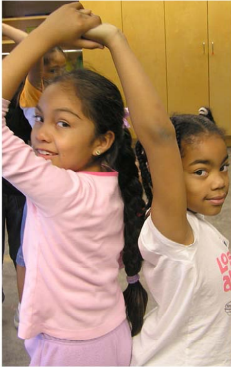
15: Freese students dancing "Verbs."

visiting artist, there's not really any kind of problem. Everybody wants to be involved and participate. Usually, behavior issues don't arise. Kids don't act up because they want to be there. It's not, 'This is too hard for me so, instead, I'll act out.' It's enjoyable and fun. So, I think that kind of reels them back into school for awhile."