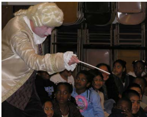
5: Mainly Mozart Assembly at Freese Elementary.

This situation is especially problematic for children who speak a language other than English at home. When young English learners first enter a traditional U.S. public school, they attempt to use their home language to communicate with teachers and peers (Saville-Troike 1987; Tabors 1997). Gradually, the children realize they are not being understood. At this point, a shift occurs. The child begins to actively attend to the new language (Ervin-Tripp 1974; Hakuta 1987, Itoh and Hatch 1978; Tabors 1997). At this stage, the child will attempt to communicate nonverbally, using gestures and facial expressions. A third stage occurs when the child masters