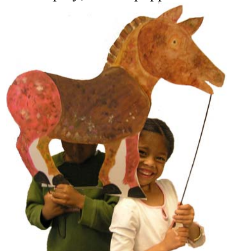
11: "Neigh, neigh!" ... "Want to go for a ride?" said the horse to the spider, as Freese kindergarteners perform "Very Busy Spider."

When the children sit down on the carpet again, the teaching artist brings out the puppets, one at a time. Student(s) are chosen to manipulate each puppet, walking it around the circle, working on movement and cooperation