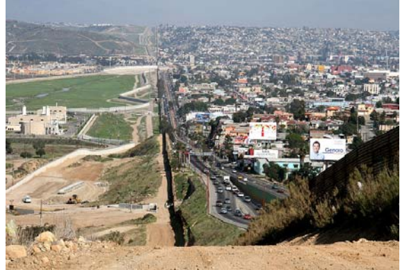
18: View of US/Mexican border divide.