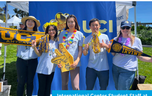
International Center Student Staff at Celebrate UCI

Carry your new address information with your immigration documents when you travel because you will need the specific address of your destination.