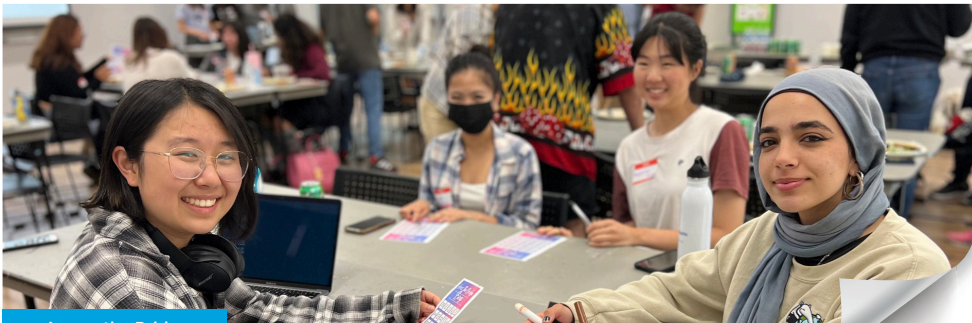
Across the Bridge