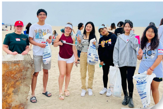
Helping Hands Beach Clean Up

The International Center offers employment, internship, and volunteer opportunities to all students. Gain professional and leadership experience with the International Center!