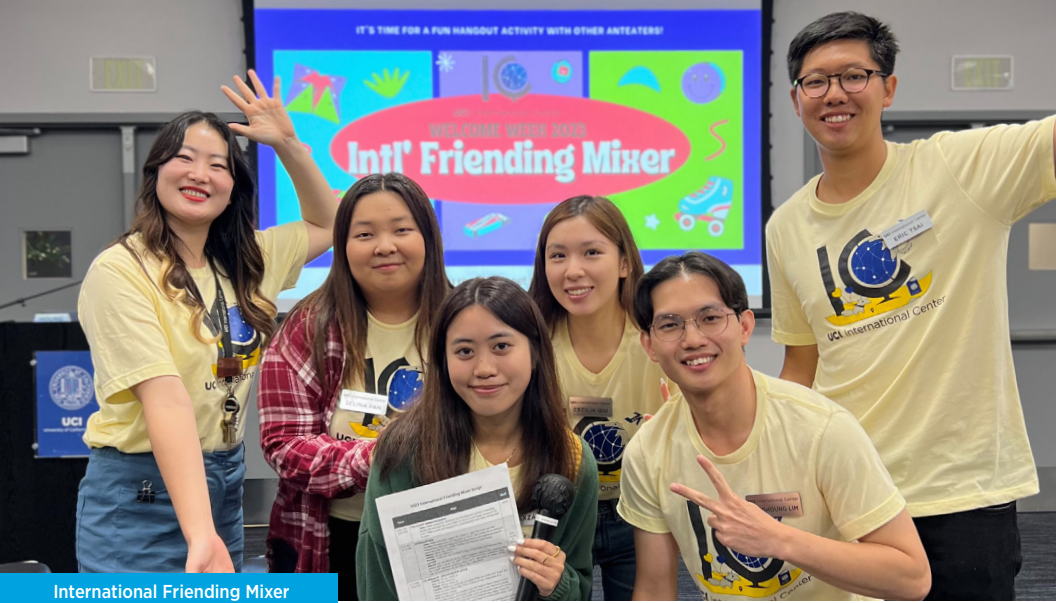
International Friending Mixer