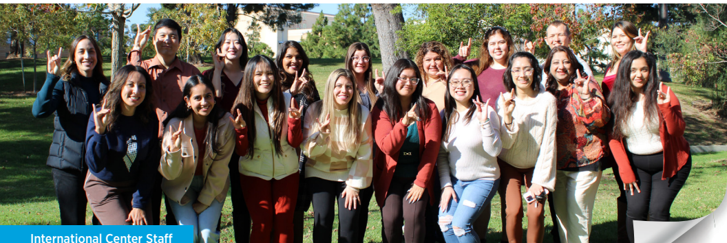
International Center Staff

Cars driven in California must be registered through the Department of Motor Vehicles. Evidence of financial responsibility must be carried at all times in the vehicle. Most Californians maintain financial responsibility through insurance companies, which provide the policy holder (you) with an identification card as evidence of coverage. The card must state the insurance company's name, address, period of coverage and policy number.