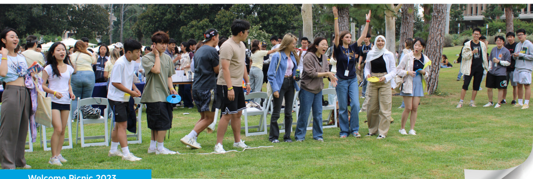
Welcome Picnic 2023