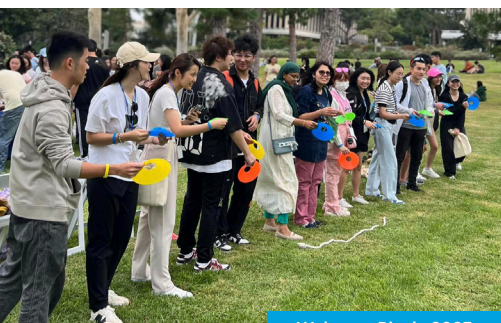
Welcome Picnic 2023

The New International Graduate Student Orientation helps new international students navigate their graduate career at UC Irvine. This event, in addition to school/department-based orientations, covers common aspects of the UCI international graduate student experience. Sessions include graduate support services as well as important administrative topics. This event gives new international graduate students the opportunity to connect with fellow international students from other disciplines across campus.