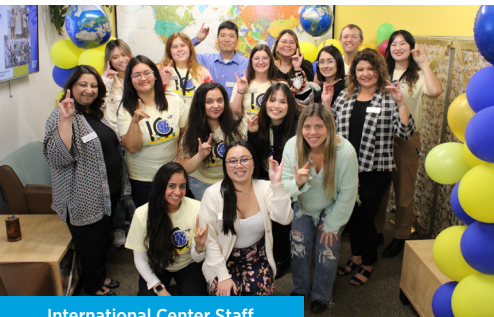
International Center Staff

THE UCI INTERNATIONAL CENTER IS YOUR ONLY SOURCE FOR VISA INFORMATION.