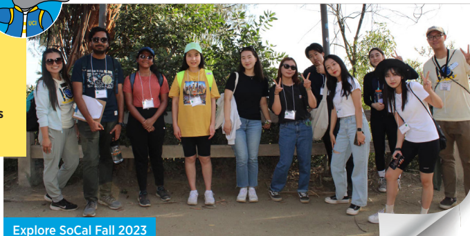
Explore SoCal Fall 2023

Carry all of your documents with you because you will need to have access to these important documents at the port of entry. Do not pack documents in checked baggage.