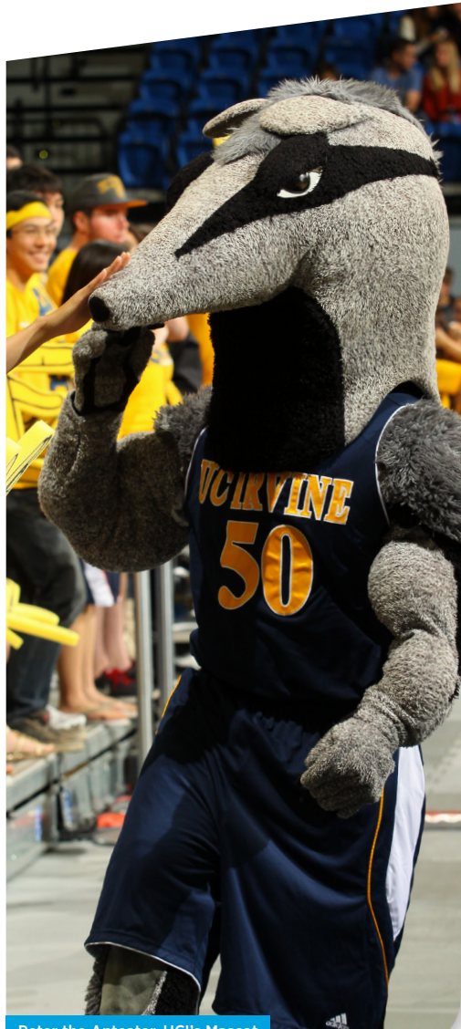
Peter the Anteater, UCI's Mascot

Rainy season in Southern California runs from December to March.