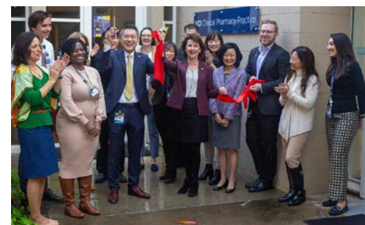
Ribbon Cutting at the entrance of Berk Hall

► Click here to subscribe to our e-newsletter to receive news from the UCI School of Pharmacy & Pharmaceutical Sciences.