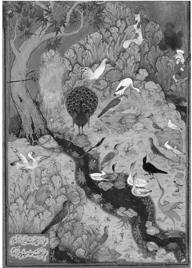
"The Concourse of the Birds" Folio 11r from a Mantiq al-tair (Language of the Birds); Habiballah of Sava; ca. 1600; Ink, opaque watercolor, gold, and silver on paper; 10 x 4 1/2 in.; Metropolitan Museum of Art, Fletcher Fund, 1963, 63.210.11