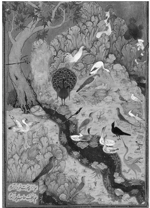
“The Concourse of the Birds” Folio 11r from a Mantiq al-tair (Language of the Birds); Habiballah of Sava; ca. 1600; Ink, opaque watercolor, gold, and silver on paper; 10 x 4 ½ in.; Metropolitan Museum of Art, Fletcher Fund, 1963, 63.210.11