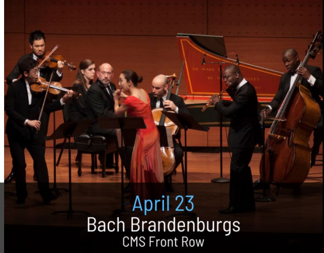
April 23 Bach Brandenburgs CMS Front Row

Register for free at http://go.middlebury.edu/pasregistration/