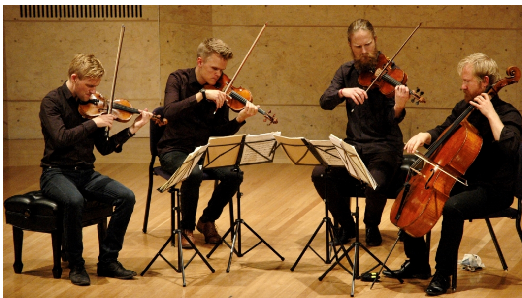
The Danish String Quartet perform in the Mahaney Arts Center's Robison Hall, in October 2017, as part of the Middlebury Performing Arts Series' 98 th season.

In 2020–2021 the Danish String Quartet introduces Doppelgänger , an ambitious four-year international commissioning project. Doppelgänger pairs world premieres from four renowned composers—Bent Sørensen, Lotta Wennäkoski, Anna Thorvaldsdóttir, and Thomas Adès—with four major works from the masterful chamber music repertoire of Schubert. Each season, the Danish String Quartet will perform a world premiere on a program with its doppelgänger—the Schubert quartet or quintet that inspired it—culminating in the premiere of a quintet by Adès, after the great String Quintet in C Major. The Doppelgänger pieces are commissioned by the Danish String Quartet with the support of Carnegie Hall, Cal Performances, UC Santa Barbara Arts & Lectures, Vancouver Recital Society, Flagey in Brussels, and Muziekgebouw in Amsterdam. The first commission, composed by Bent Sørensen and inspired by Schubert's quartet in G Major (D.887), is scheduled to premiere in 2021.