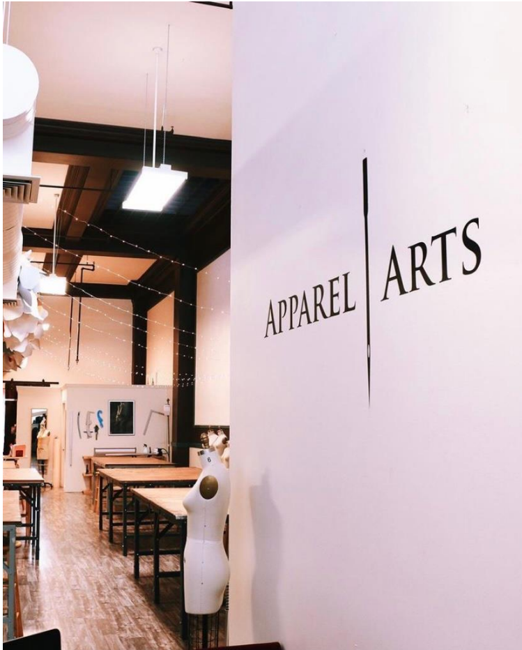
An image of the Apparel Arts school from 2019