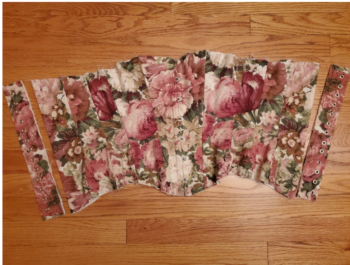
Ola Zalecki's corset before attaching lacing placket