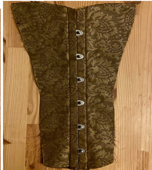
Center front w/ busk of Piara Bigg's corset