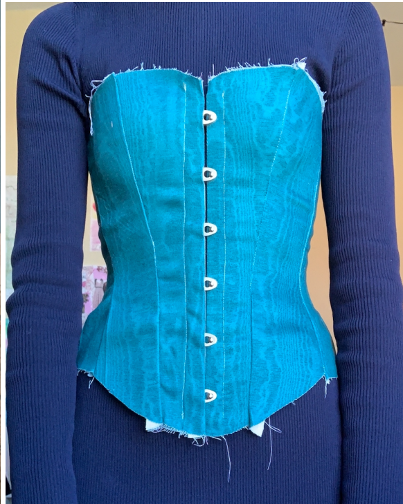
'Fit' corset, made with muslin fabric for initial fitting Corset with final fabric before alterations & binding seams