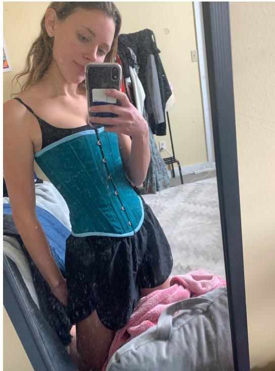
My final corset (excuse the mess and mirror!)