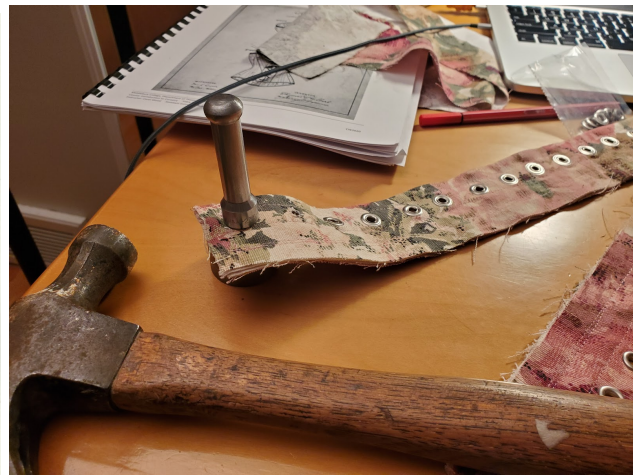
Ola Zalecki inserting grommets for corset's lacing placket