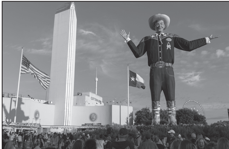
In 2016, Big Tex greeted visitors as they entered the Texas State Fair.