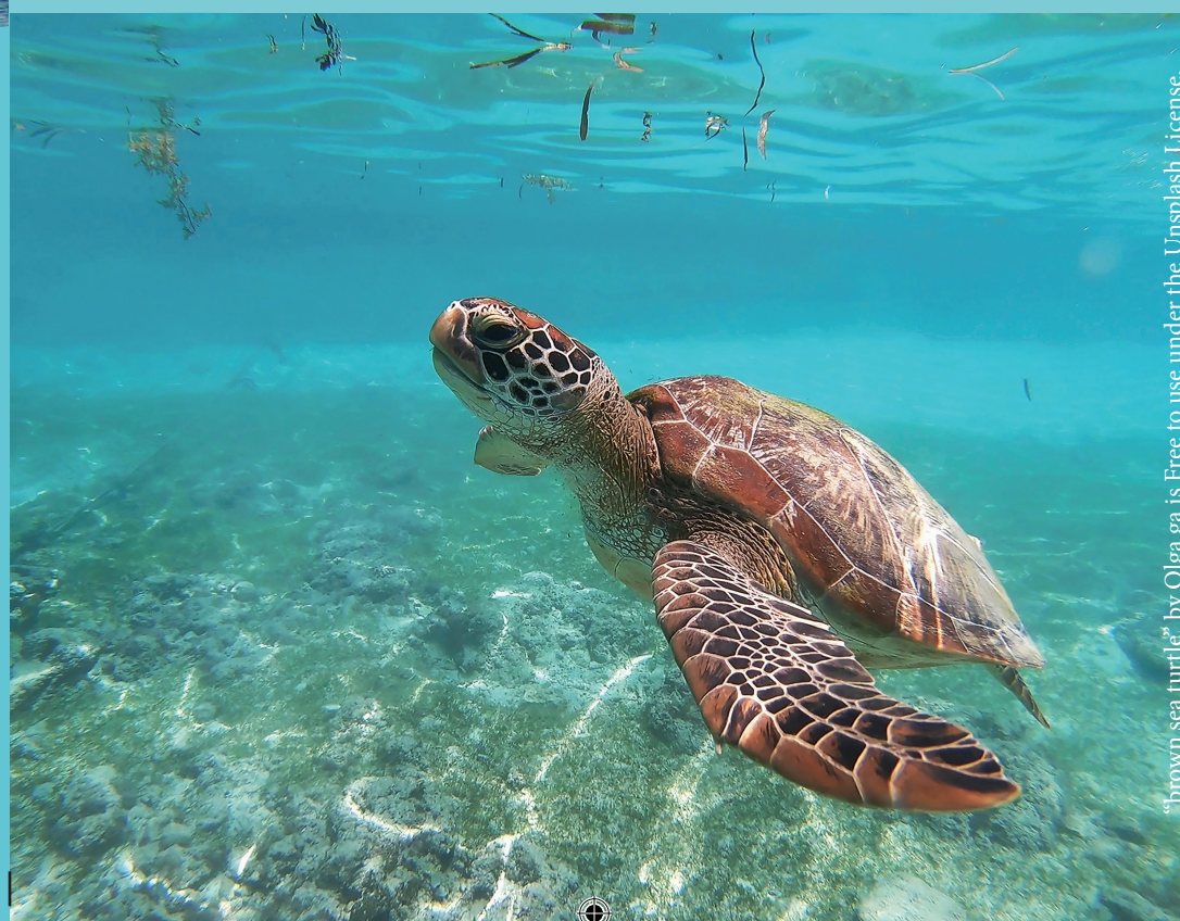
"brown sea turtle" by Olga ga is Free to use under the Unsplash License.

On this turtle nesting tour, you will have the rare chance to see Olive ridley and Pacific green turtles lay their eggs and sometimes even see the babies hatching and going out to sea!