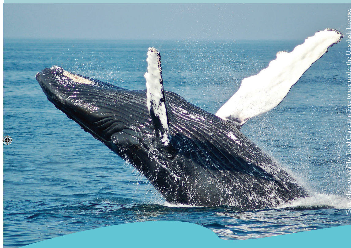
"Blue whale on sea" by Todd Cravens is Free to use under the Unsplash License.